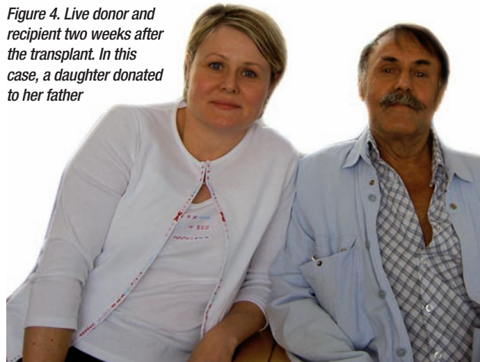
Figure 4. Live donor and recipient two weeks after the transplant. In this case, a daughter donated to her father

various appointments. This necessitates time from work, which may have a financial implication. The operation involves a hospital stay of three to five days and, afterwards, a recuperation period of six to 12 weeks. It is possible for the donor to claim for compensation for loss of earnings, to make up any shortfall in his income, attributable to the donation.