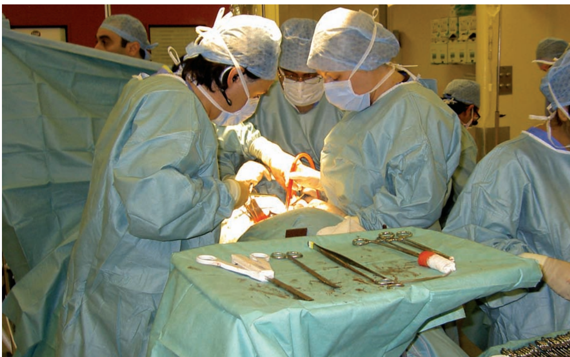
Figure 3. The open surgical approach

The process of living kidney donation can be an emotional 'rollercoaster', both for the donor and