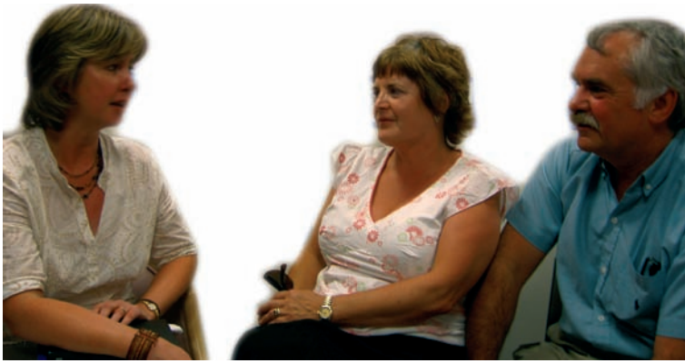
Figure 1. The live donor co-ordinator consults with potential donors

care enough. However, in the UK, there is a considerable shortfall of cadaveric organs available for transplantation. Therefore, to increase the number of kidneys available for transplantation, living donation is explored more vigorously. Living kidney donation offers the potential for a superior form of treatment and kidneys transplanted from living donors have the potential to work better and to last longer than transplants from cadaveric donors.